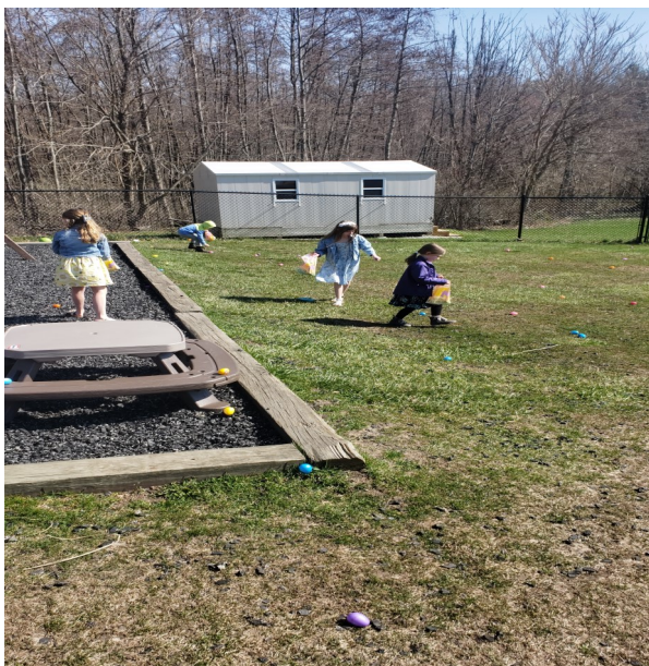
Everyone had fun at the Easter Egg Hunt!