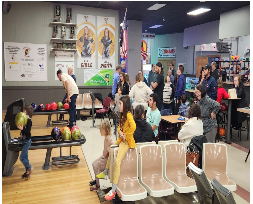
Bowling at Inman's in February was fun for all!